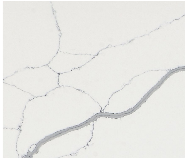
Control Sample Acceptable Test Sample